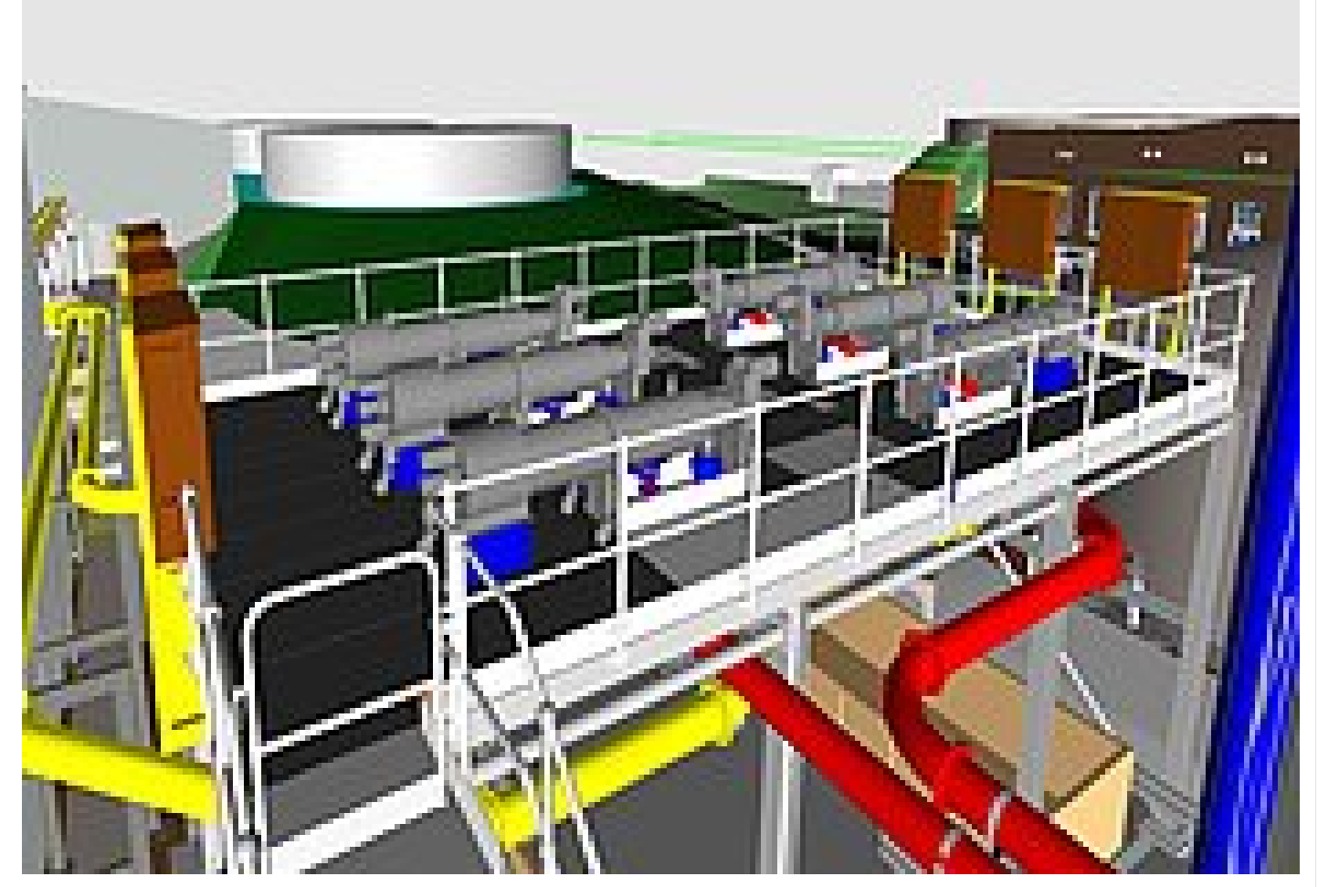
BIM 360 Design Package