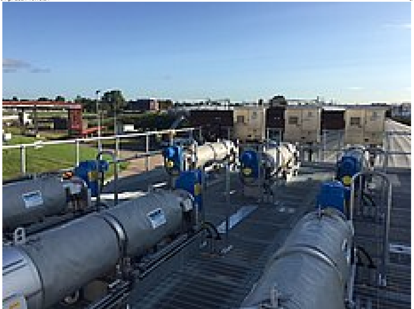
Minworth STW STRAINPRESS® Installation

HUBER Sludgecleaner STRAINPRESS® – Sludge Screening to remove solids and rags from imported municipal sludge prior to thickening or dewatering. Benefits include high solids removal, low energy consumption, 366 UK reference sites, simple robust design and fully automated operation.