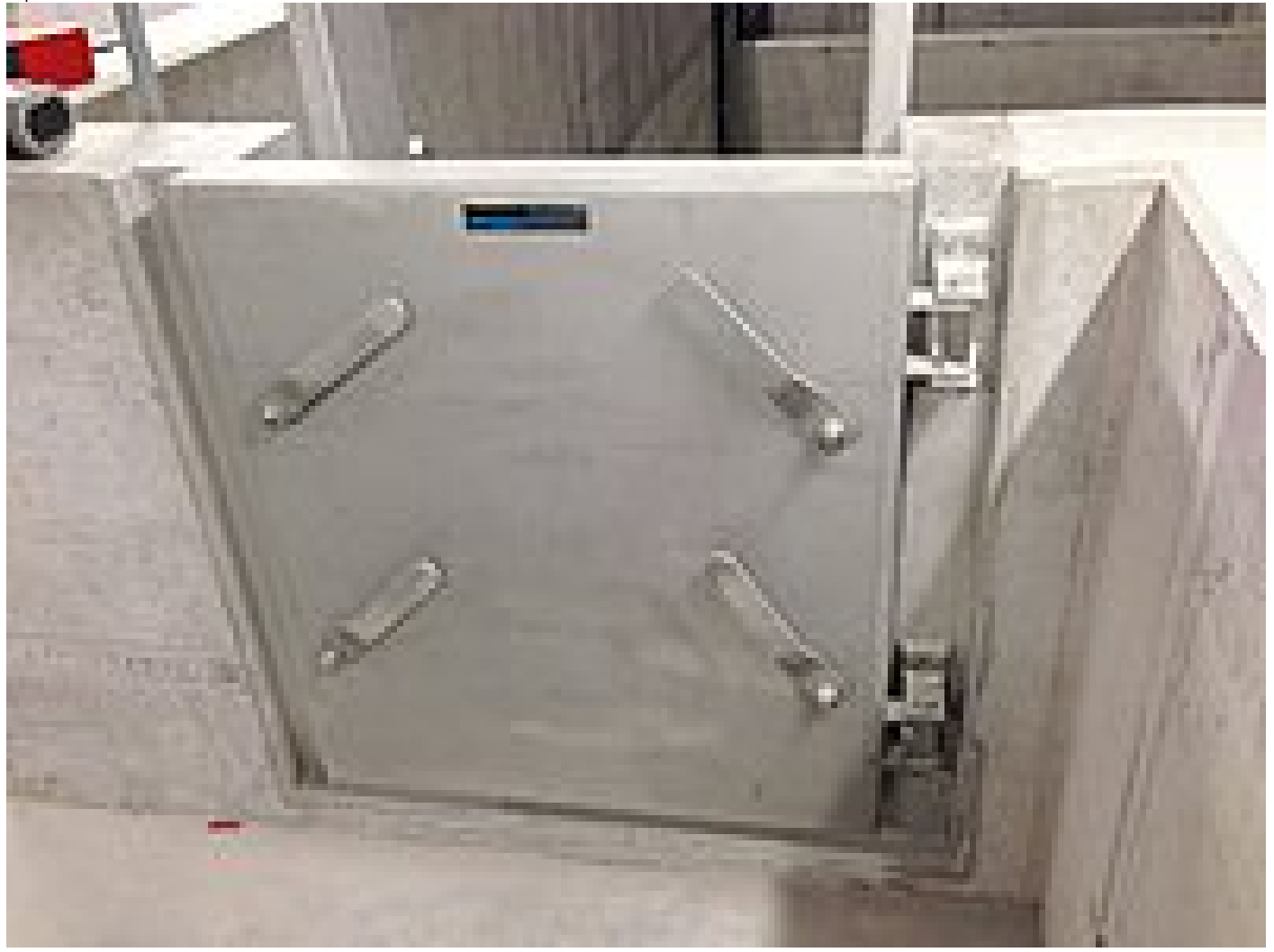
Half-high locking lever

Now as the stormwater tank has been erected the combined water (stormwater and domestic wastewater) from the sewers can be stored and passed on to the sewage treatment plant after storm events. At the tank inlet the stormwater is treated at first with HUBER HSW screens. If the stormwater tank capacity is exceeded, the water passes a second treatment stage before the overflow is discharged to the receiving water course. In this way the pollution load the receiving water course has to cope with is reduced to a great extent.