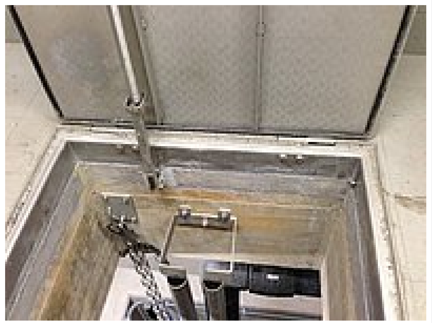
Manhole cover SD7 with reduced installation height

Due to ever increasing surface sealing high amounts of rain water occur suddenly and flow into the sewer system along with domestic wastewater. As the stormwater amounts which occur are very high therefore, the flow capacity must be regulated by means of stormwater tanks to relieve the sewer system. The municipality Ruggell therefore commissioned the engineering office Wenaweser+Partner Bauingenieure AG in Ruggell (Liechtenstein) to plan the stormwater tank "Kirche".