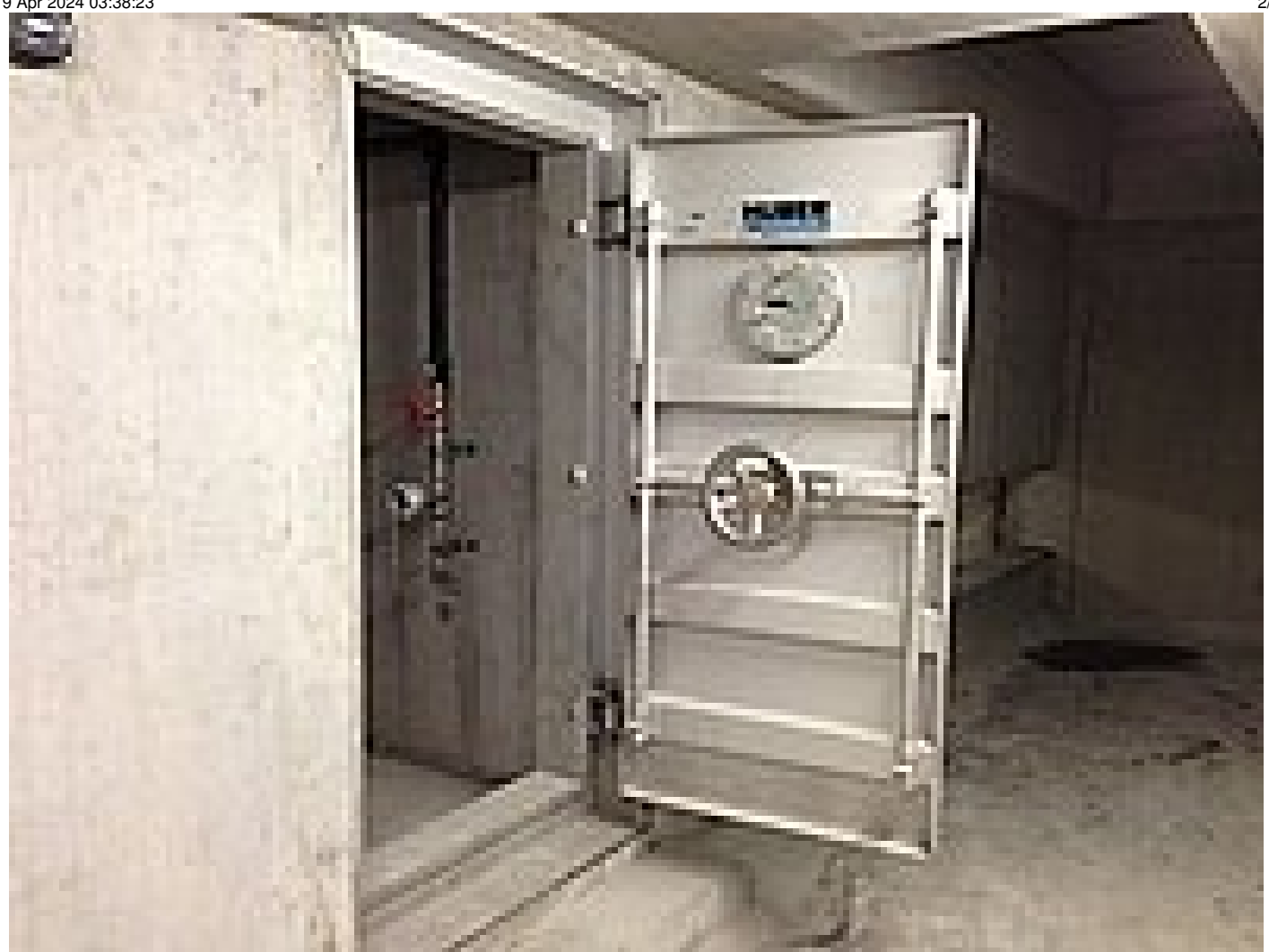
Pressure door with central lock