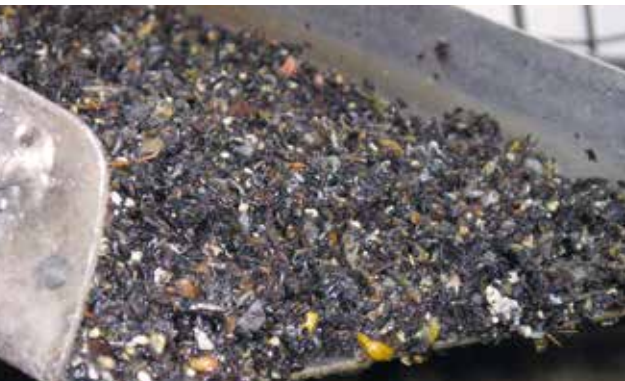
Untreated grit from STPs