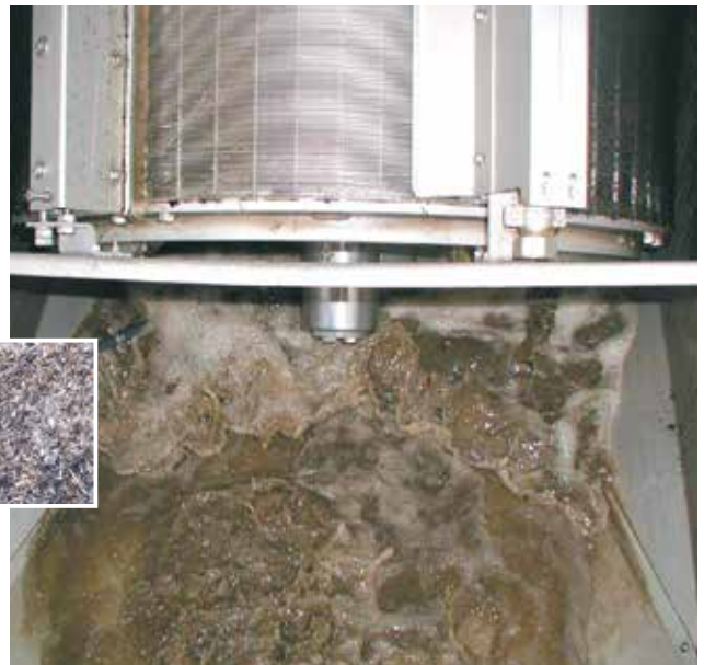
HUBER Rotary Drum Fine Screen ROTAMAT® for 1 mm screening and dewatering of organic material (approx. 30 % DR).