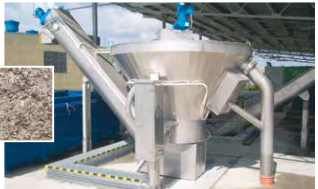
Washed grit from HUBER Coanda Grit Washer RoSF4 with < 3% loss on ignition, particle size up to 10 mm, DR > 90%.