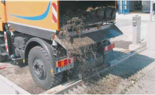
Acceptance tank with bar grate and integrated horizontal dosing screw.