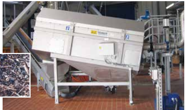
HUBER Wash Drum RoSF9 for washout and separation of all coarse material > 10 mm.