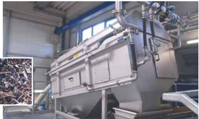
HUBER Wash Drum for washout and separation of all coarse material > 10 mm.