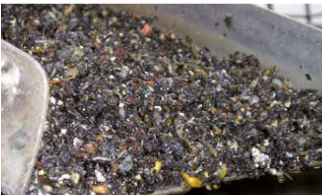
Untreated grit from STPs