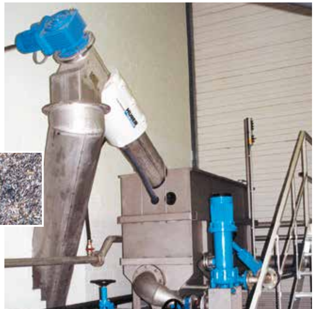
ROTAMAT® fine screen for 1 mm screening and dewatering of organic material (approx. 30% DR).