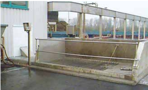
Acceptance tank with bar grate and integrated vertical dosing screw.