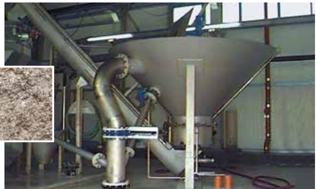
Washed grit from Coanda Grit Washer with < 3% loss on ignition, particle size up to 10 mm, DR > 90%.