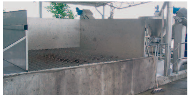
Acceptance tank for above-ground or underground installation