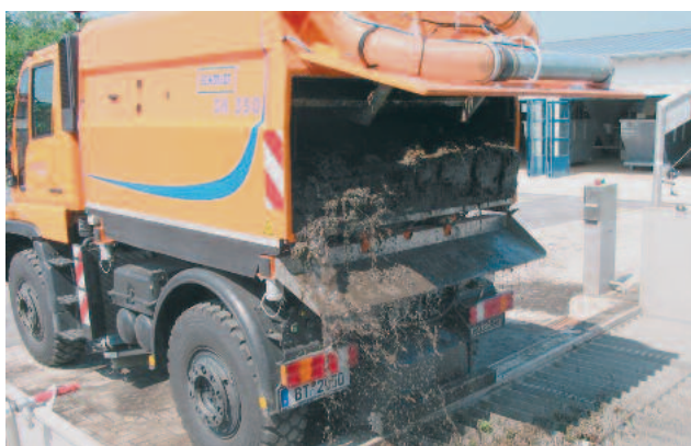
RoSF5 HWS system: Acceptance tank with horizontal dosing screw