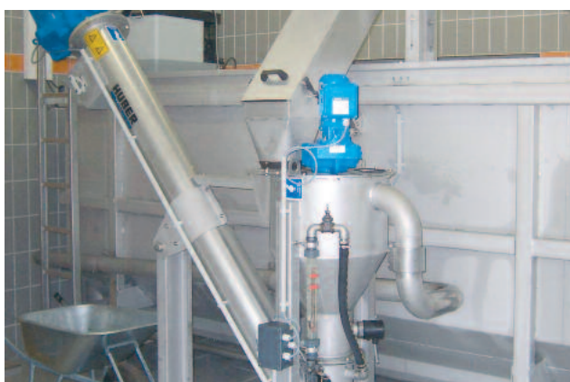
Small HUBER Grit Washer RosF4 TC washing classified grit from a HUBER Complete Plant ROTAMAT® Ro5