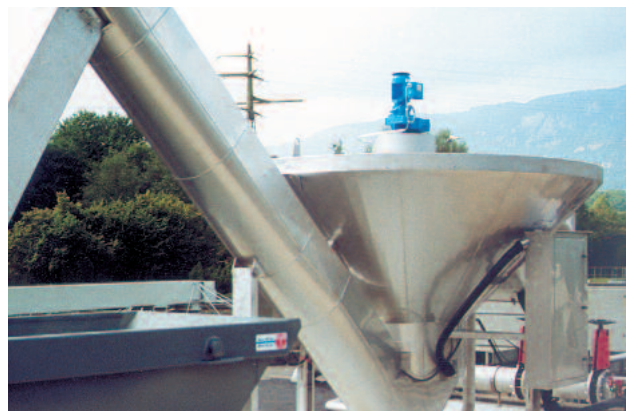
Innovative technology: HUBER Coanda Grit Washer RoSF4 size III, heated plant for outdoor installation