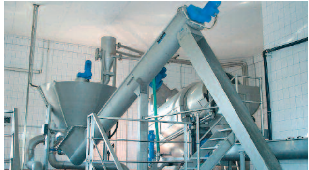
Wash Drum and Grit Washer installed in the customer's building