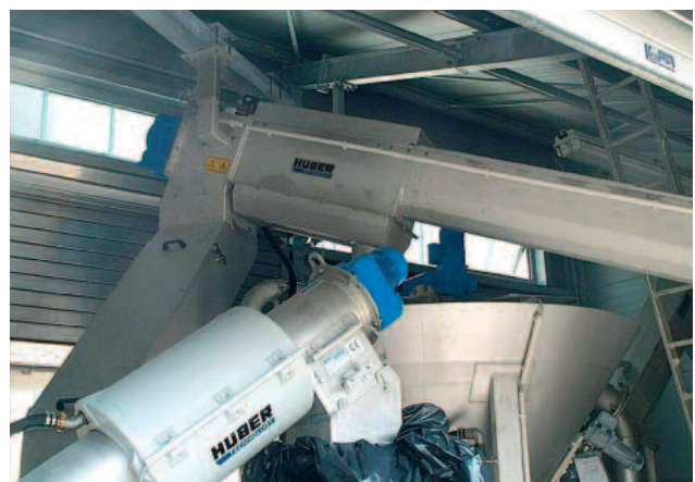
Effective separation with the RoSF5 VR system