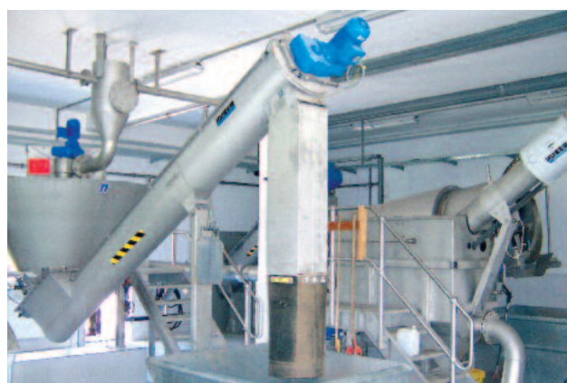
Sewer grit treated with the RoSF5 VWS system is recycling material.