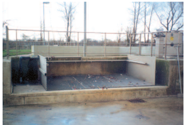
Acceptance tank of the RoSF5 HP system