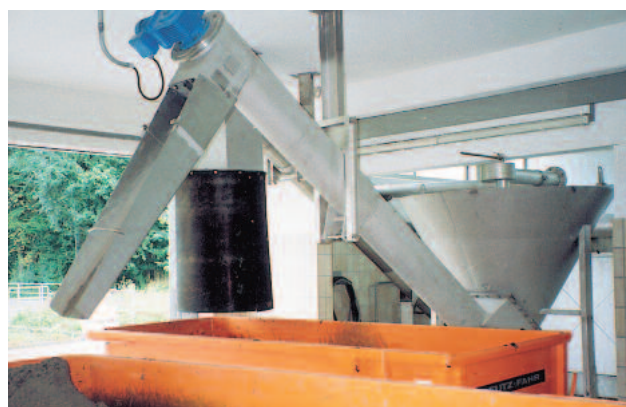
HUBER Coanda Grit Classifier RoSF3 installation