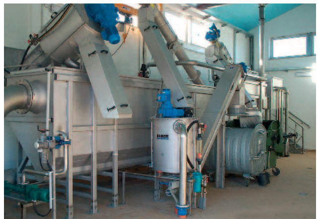
The HUBER Grit Washer RoSF4 T washes any grit