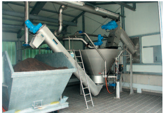
HUBER Coanda Grit Washer RoSF4 for improved hygiene and reduction of disposal costs