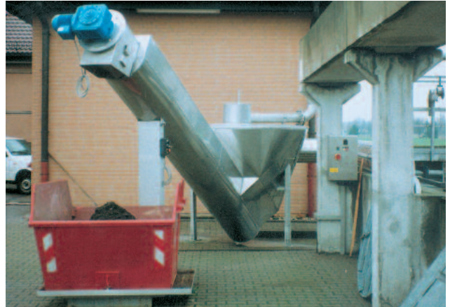
HUBER Coanda Grit Classifier RoSF3 installed subsequent to a grit channel