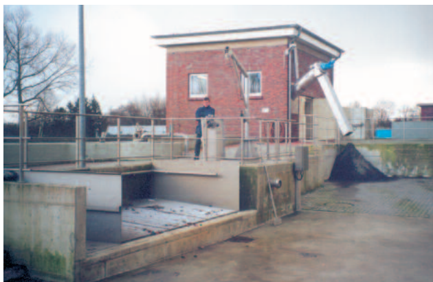
The RoSF5 HP system allows for long distances between the tank and Grit Washer.