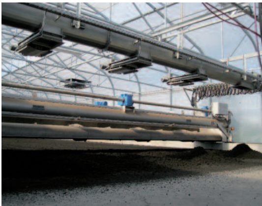
Sludge turner before sludge feeding