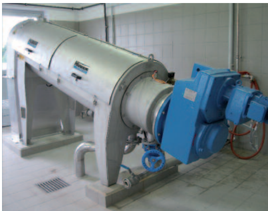
RoS 3Q 440 dewatering thin sludge

Packed lunch will be provided for all participants.