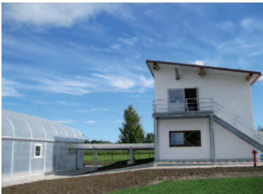
Sludge feeding to the greenhouse directly from the dewatering unit

The plant operators and municipality are very satisfied with the installed system.