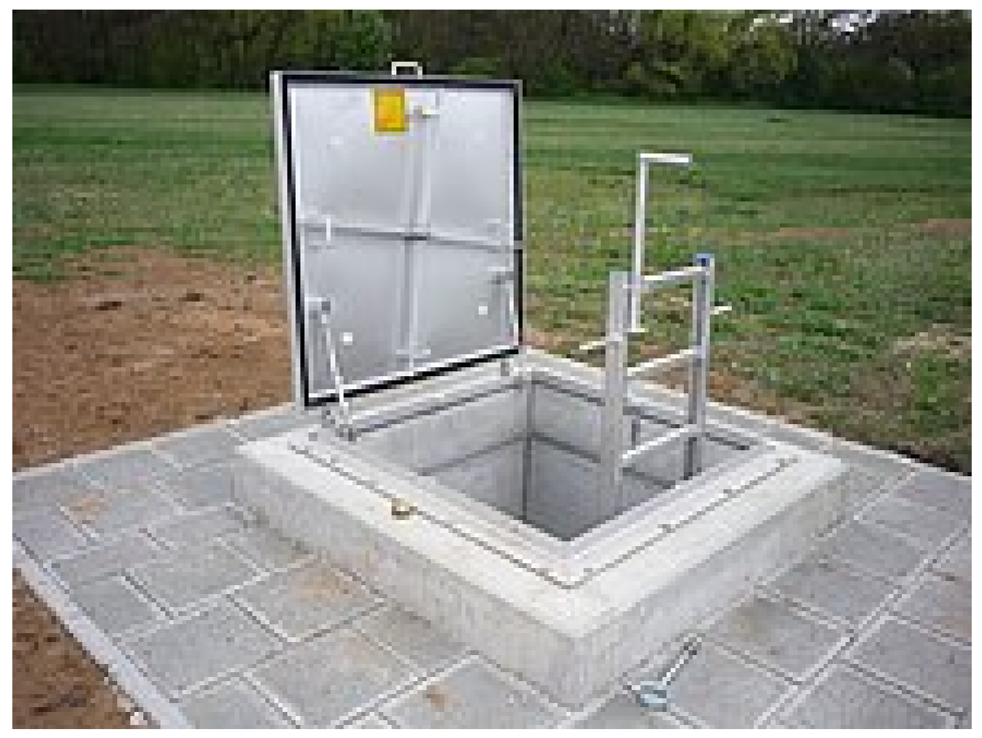
Newly refurbished manhole

The regular inspection of installations is an important aspect not to be underestimated where drinking water and wastewater structures need to be maintained as valuable elements of our supply and disposal networks.